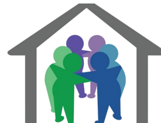
Neighbors Helping Neighbors

So far, CSC has raised over $10,000! It was a hot day, but 243 people came to walk and 340 miles were walked. This was raised by donations from participants and $10 was donated to CSC for every person (or 4-legged) that completed the loop.