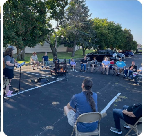
S'more Worship at Atonement in July.